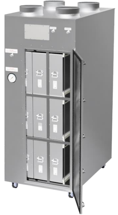
<Filter Installation on EQPT >