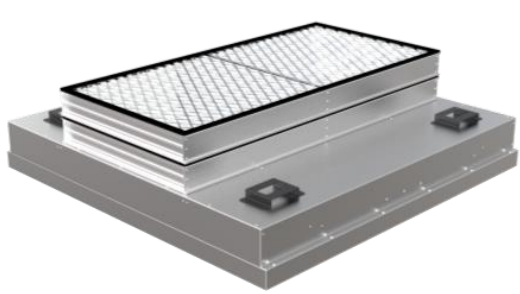
<Filter Installation on FFU >

Pleated type filter which can be customized by customers' needs is typical filter variously applied on Facility (FFU, OAC,& AHU) and Equipment.