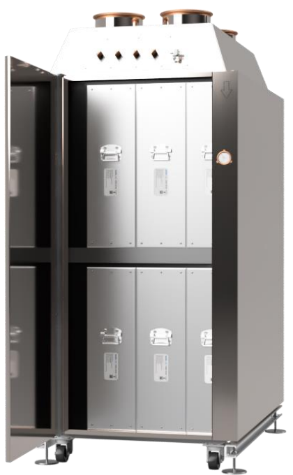
<Filter Installation on EQPT >